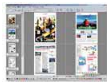
Thumbnail images / Multi-window images